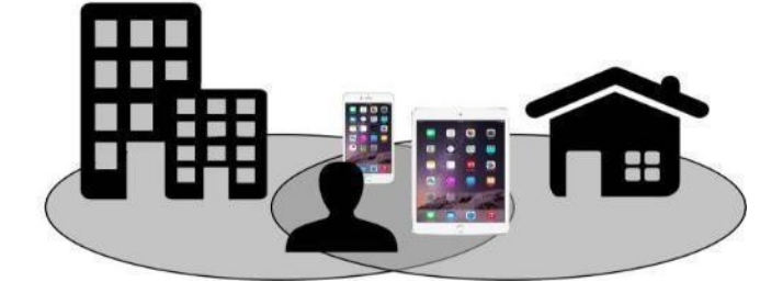
Work Related Task Personal Activities

Figure 1.1: Representation of a BYOD environment